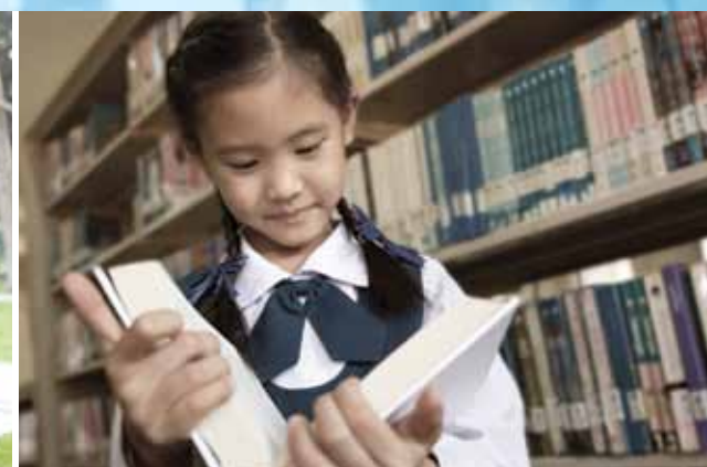
Good schools abound and within reach.