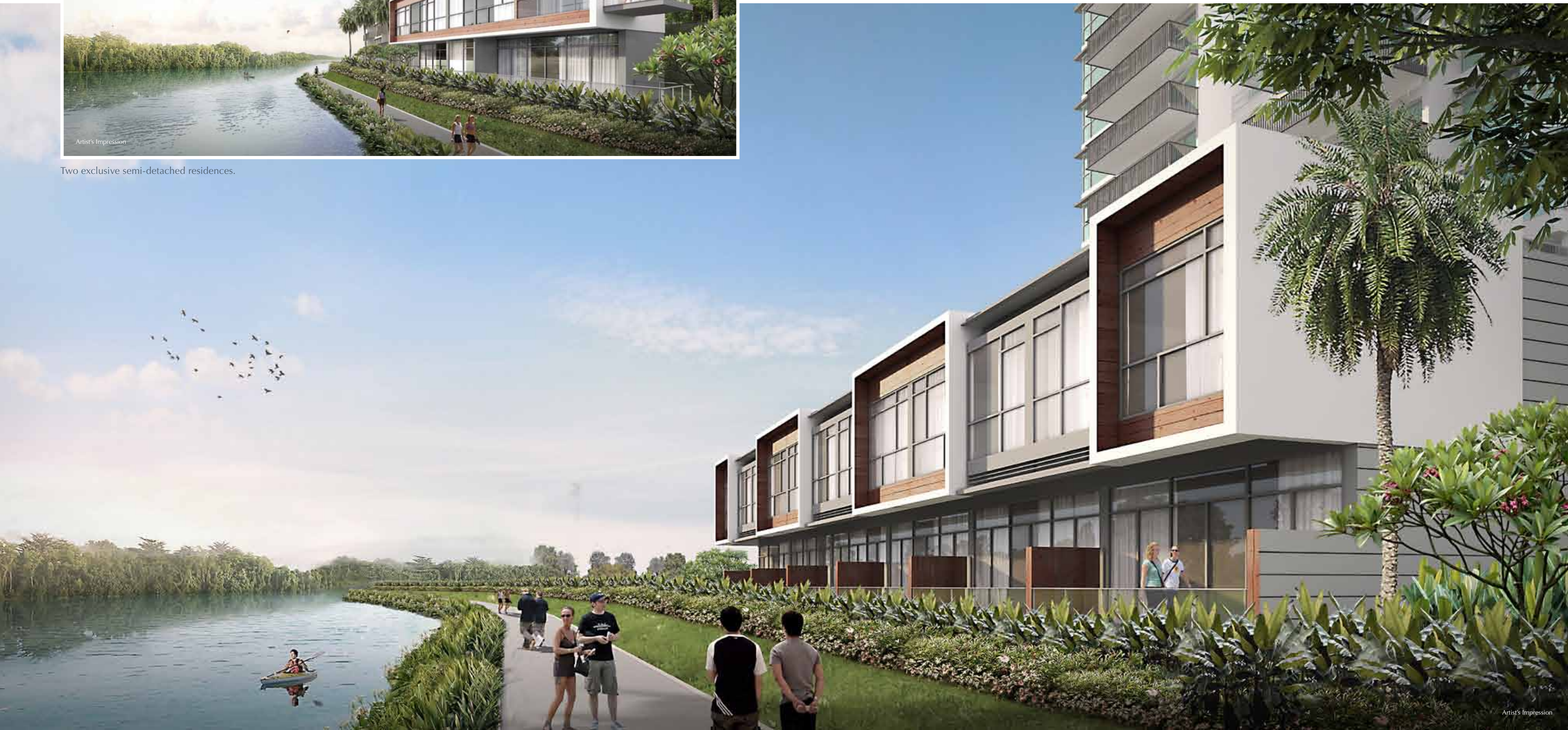
Six exquisite terrace houses.