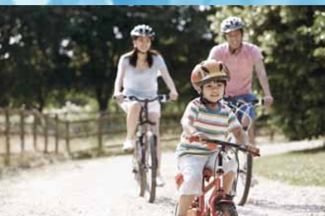
Embark on a new cycle of life.