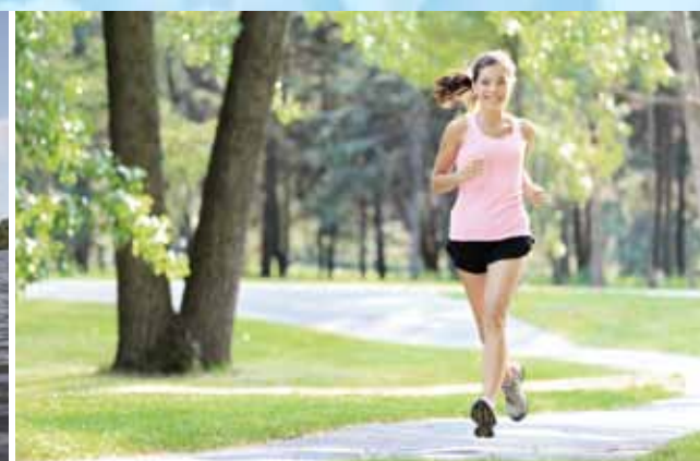
Keeping fit has never looked this good.