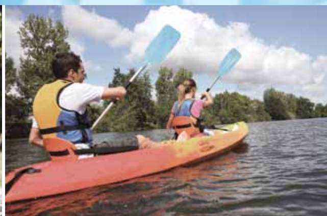
Enjoy more water-based activities.