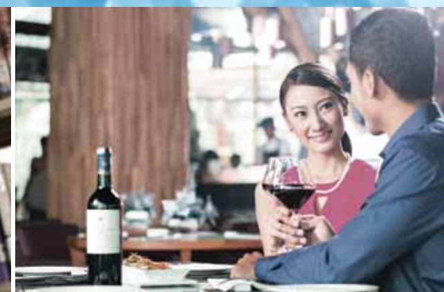
Close to eateries and restaurants.