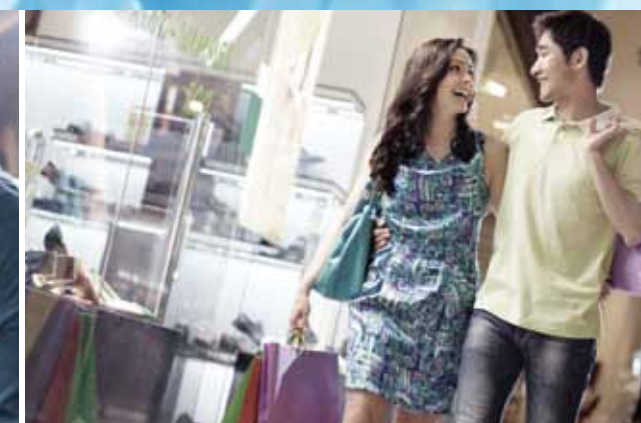
Minutes to Hougang Mall and NEX Shopping Mall.